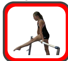
Advanced GymKids (6+ yrs) $228/session