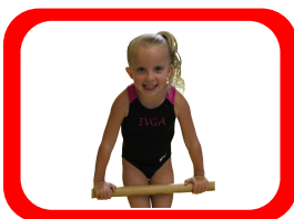
Tiny Tumblers (3 yr olds) $162/session