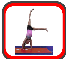
Kinder GymKids (5-6 yrs) $162/session

Session 4: Summer 2019 June 3rd - August 23rd