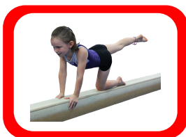
Mini Gym Kids (New 4-5 yr olds) $162/session