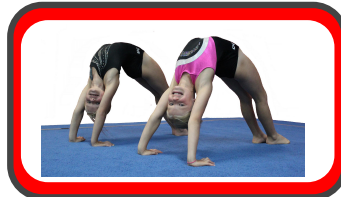
Intermediate GymKids (6+ yrs) $228/session